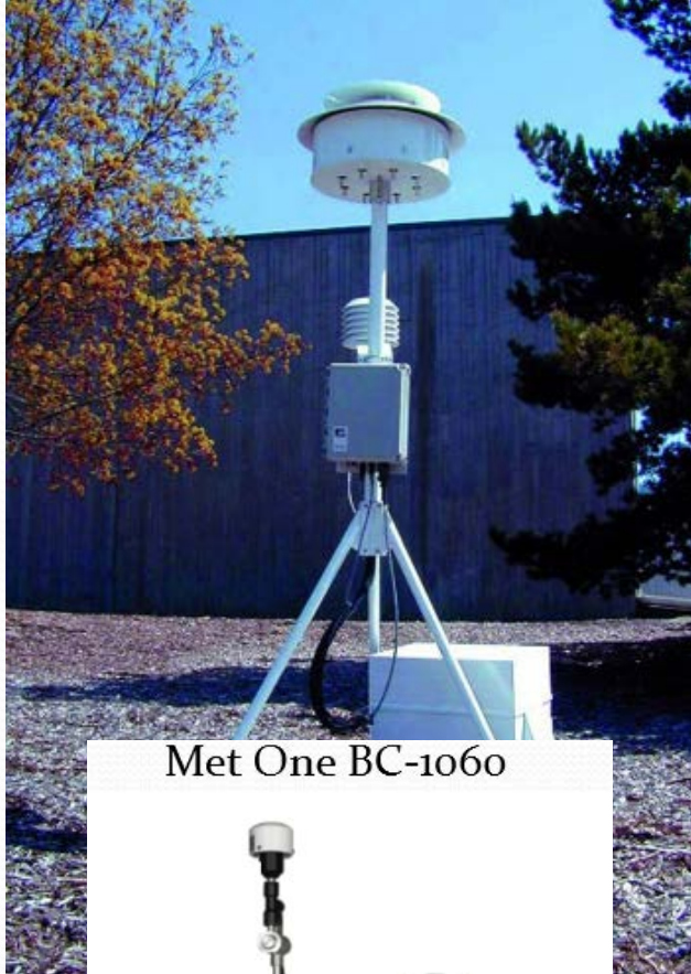
Met One BC-1060