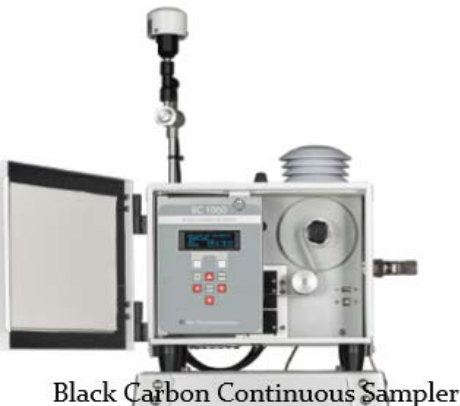
Black Carbon Continuous Sampler