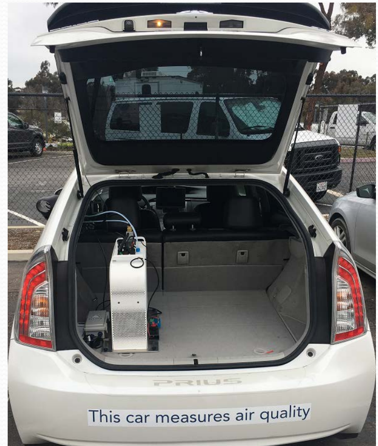
This car measures air quality