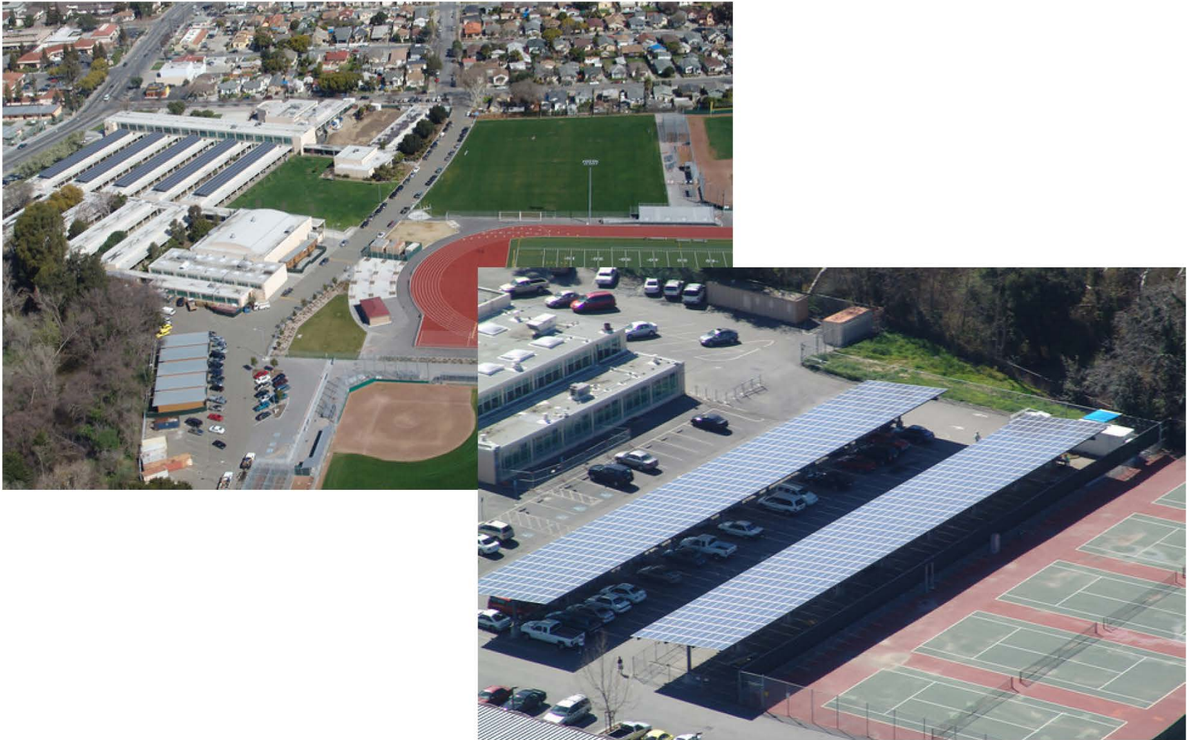
San Jose Unified School District, San Jose, CA Solar PV and efficiency project (5.5 MW funded by Bank of America)