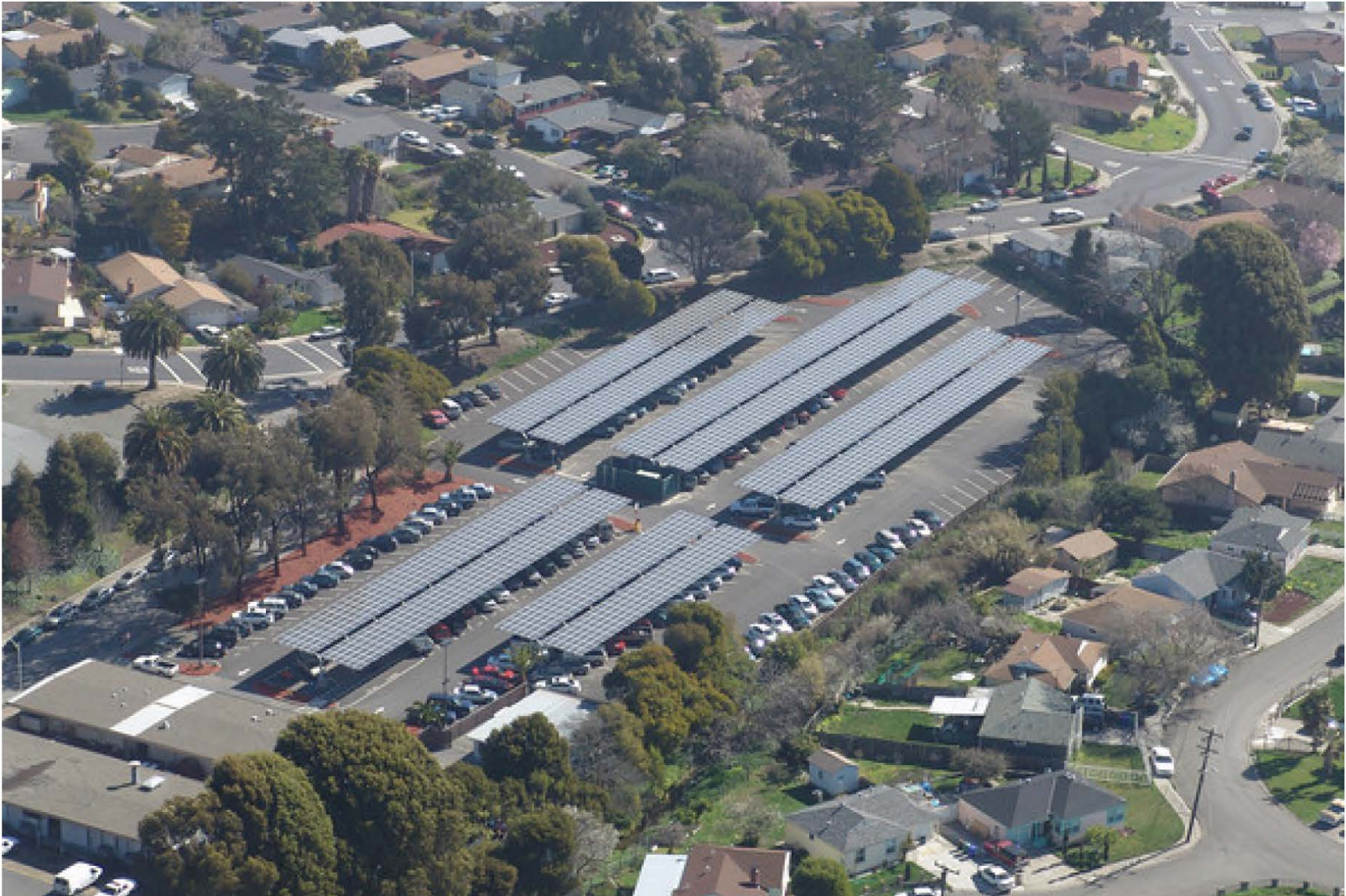
Contra Costa College, San Pablo, CA Solar PV/efficiency project (Bond funded)