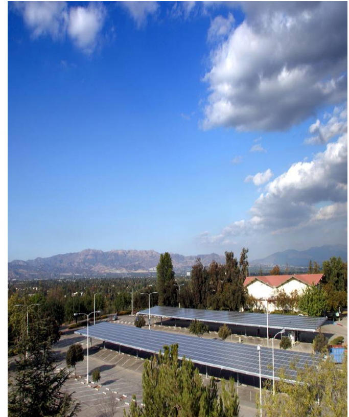
Pierce College, Woodland Hills, CA Solar/cogeneration/efficiency project